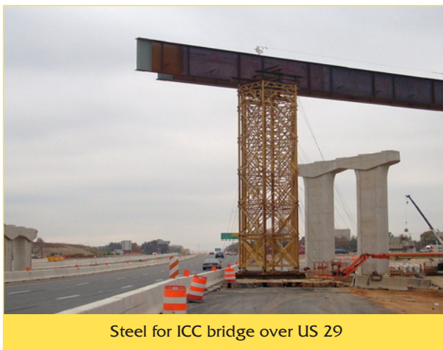
Steel for ICC bridge over US 29

Work is progressing on the new ICC bridges over I-95 and US 29. In both locations, crews are lifting steel beams and setting them in place for the bridge deck. When this type of construction activity occurs, the roadway will be closed for short periods for safety reasons. These road closures will happen only at night, when traffic is much lighter. Periodic lane closures will continue on northbound and southbound I-95 through the end of spring until all of the steel beams are in place for the new flyover bridge that will ultimately carry traffic from eastbound ICC to northbound I-95. This bridge is expected to be completed by early 2011. Another new bridge carrying the ICC over I-95 is scheduled for completion later this fall.